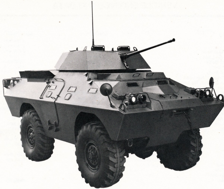
AM330 ARMORED 20mm WEAPON STATION