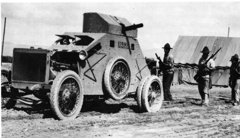
King of the 1st Armored Car Squadron with Marines in an anti-riot wedge in Haiti. The armor for the radiator and motor has been removed to reduce tropical cooling problems. The term "squadron" reflects the intended reconnaissance role for the cars.

made a fully armored car with machine-gun turret. In 1906 the Russian Army bought 10 of the French cars. In 1905 Austria developed a four-wheeled drive, turreted armored car. The Italians, in 1912, built armored cars on Fiat truck chassis. Further development awaited the exigencies of war. That war came soon enough with the invasion of Belgium and France by Germany in August 1914.