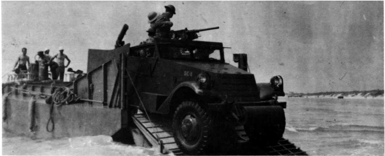
M3A1 scout car landing from an LCM-6, circa 1941. The M3 and motorcycles with sidecars equipped the 1st and 3d Scout Companies of the 1st and 2d Marine Divisions, until jungle operations on small Pacific islands made their use impractical. The scout companies were in the South Pacific in early 1942 but when the divisions moved north the cars were left in New Zealand.

advance Base Force Brigade and deployed to the Island of Hispaniola for duty in both Haiti and Santo Domingo. On 4 May 1921 the squadron was deactivated.