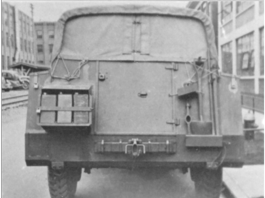
Photos: Above, C15TA at the General Motors of Canada plant in Ontario.

Remarks: Built as a supplement and later replacement for the U.S. developed White M3A1 Scout Car, the primary role of the C15TA was as a forward area armored personnel carrier. The vehicle could also be easily converted to a General Service armored truck, ammunition carrier or a two-stretcher ambulance (a special armored ambulance was also produced separately, which had additional space for personnel and medical supplies). As it was, the APC version had enough storage space to carry the weapons and equipment for eight men. The C15TA was a well made vehicle, and remained in use well into the '60's; the C15TA cost approximately $4,500 (1943 Canadian dollars) to build.