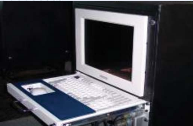
Control Console inside the Vehicle

Upon detection of a metal object, an electronic signal is sent to the control console inside the vehicle.