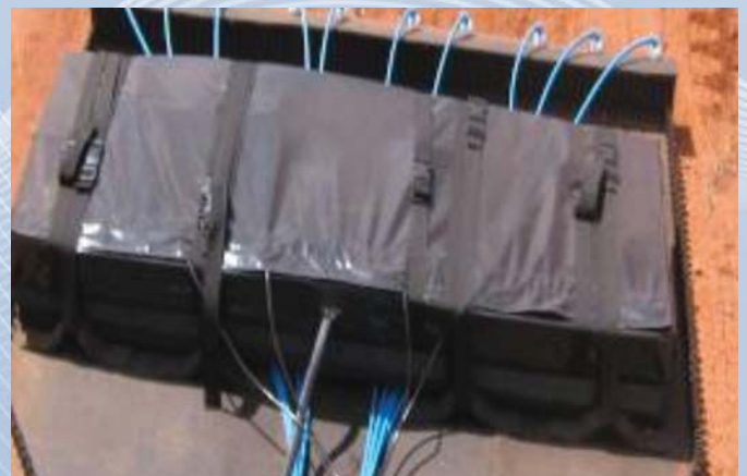
Draw Mat with Marking Nozzles at the rear

The detection coils are mounted on foam rubber mats that are positioned on to the rear end of the draw-mat.