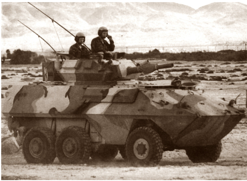
Top: Pre-production MOWAG Cougar as built for the Canadian Army. (Photo: MOWAG Motorwagenfabrik). Above: Canadian Defence Force Cougar on loan to the US Marine Corps for testing, circa 1981. (Photo: US Navy)

Remarks: An initial order for the Canadian Army was placed in January of 1977 for 152 vehicles. The Cougar had a service life of well over 20 years and in photos will appear with the unprotected rear propulsion propellers swiveled in an upright position against the rear hull. This was later modified with the addition of a protective shroud over the unit; and finally near the end of its' service life, no water propulsion unit at all.