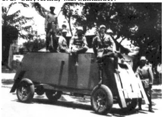
Above: Improvised armored car completed in 1929 for the Colombian Army.

Remarks : The single example was built in the Santander battalion workshops in Cucuta, Colombia sometime around 1929. Only the one vehicle was completed.