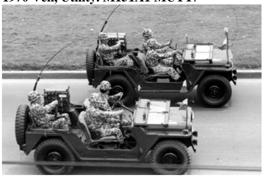
Above: On parade in Bogota circa 1975.