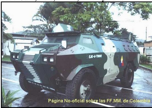
Photo: A total of 12 Avmara's have been completed and are assigned to Cavalry Group No. 4, de Rio Negro.

Remarks: Developed locally by Colombian industry to try and increase the number of armored personnel carriers available for the Colombian military. The Aymara is fitted with air brakes and a rear view camera for backing.