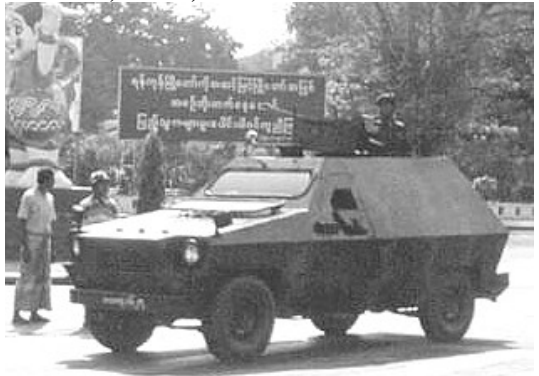
1985 Car, Armd, 4x4. Local Production.

1965 Veh, Recce, 4x4, Ferret Mk 2, FV701E, (see UK for vehicle details).