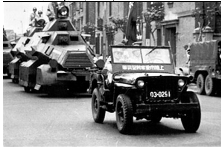
Above: One of many softsking support vehicles supplied by the U.S. To the Chinese Nationalist Army (photo circa 1949)