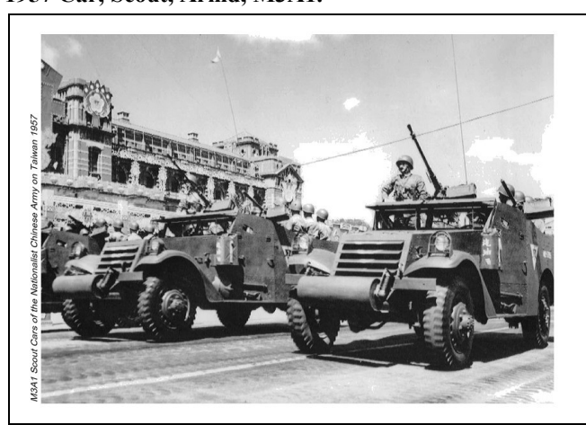
(see US for vehicle details)