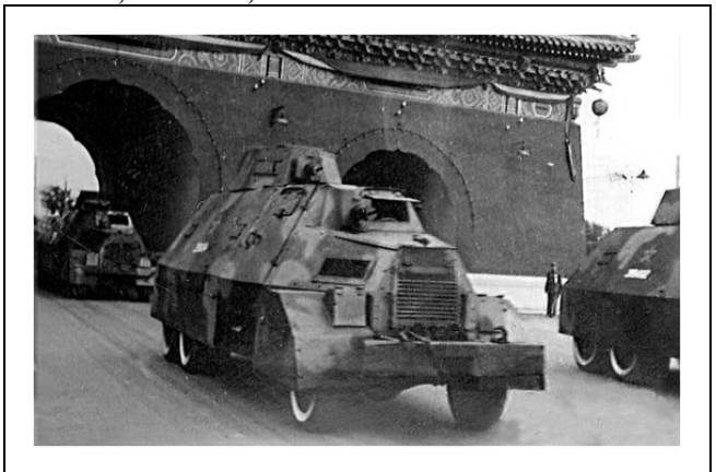
Originally a Nationalist design as above, some of the 6x6 armored cars were taken into Communist Chinese Army service.