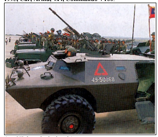
(see US for vehicle details)