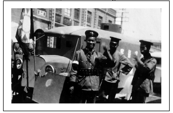
1935 Car, Armored, 4x2 Local Build Mod. 1935.

1928 Car, Armored, 4x2 General Feng No. 1.