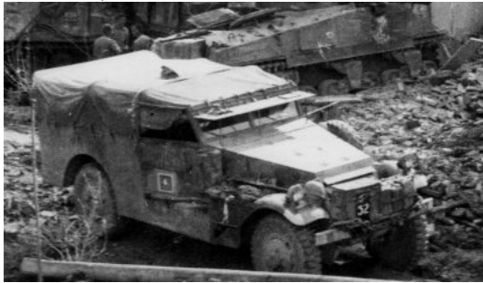
Above: M3A1 Scout Car with a tank recovery unit in Italy, circa 1943.

Remarks: See US, M3A1 for vehicle details.