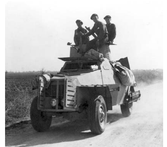
Above: New Zealand SA Recce Car Mk II in North Africa. (Photo: Author's collection).

Remarks : New Zealand forces had already received the Mk 2 when they were transferred to Greece from North Africa in March 1941. Three of the cars' serial numbers were, F22761, F22768 and F22783 (see South Africa, SA Recce Car Mk 2 for vehicle details).