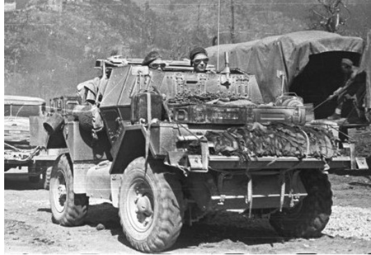
Above: Canadian built Ford Lynx with New Zealand forces in Italy.

Remarks : Besides using the Dingo scout cars, at least some Canadian built Ford Lynx vehicles were used in Italy as well (see Canada for vehicle details).