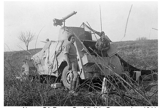
Above: SA Recce Car Mk II in Greece circa 1941.

1941 Car, Armd, 4x4. Marmon-Herrington Armored Car, Mk 2 ME.