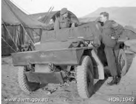
Above: New Zealand Dingo in Korea.