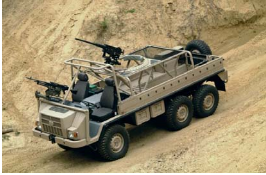
Above: Pinzgauer 6x6 Weapons Carrier, Special Operations (SO). The NZDF ordered 13 vehicles fitted as SO vehicles.

Remarks : Developed from the SDP Pinzgauer, the latest XM (X-treme Mobility) vehicle switched from an air-cooled engine to a fivecylinder water-cooled Volkswagen motor. The new versions can be recognized by the grille and short hood at the front of the vehicle for the cooling. All current versions of the Pinzgauer can be carried inside a C-130 or a CH-47 series helicopter. The vehicle can also be air-dropped using a platform. While the base Pinzgauer is unarmored, both the Weapons Carrier and Special Operations versions can be fitted with module armor to increase protection to the crew and automotive components. The NZDF order a total of 321 vehicles in various configurations,