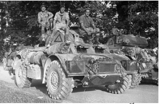
Above: T17E1's of the New Zealand 2<sup>nd</sup> Division Cavalry in Italy, 1944.

1942 Carr, Pers, Armd, 4x4. Carr, Wheeled, NZ Pattern.