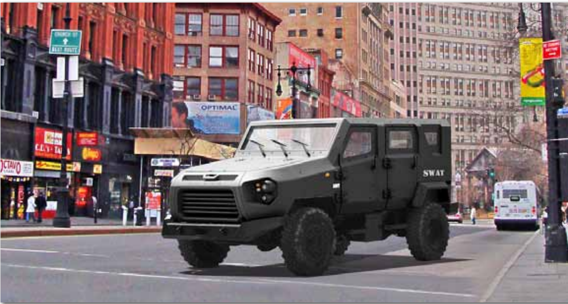
The Tiger is designed for police, border patrol and paramilitary roles involving high risk, e.g., SWAT, anti-terror, and drug enforcement units, along with similar missions requiring exceptional all-terrain capabilities coupled with extreme survivability.

Using a commercial off-the-shelf platform reduces initial cost, reduces spare parts costs and reduces maintenance costs. The unique capsule approach allows for easily re-mounting the capsule on a new pickup truck chassis, which significantly reduces lifecycle costs over the life of the capsule.