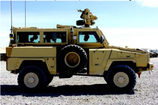
Above: RG-32 Nyala in service with Canadian Forces in Afghanistan as of 2007.