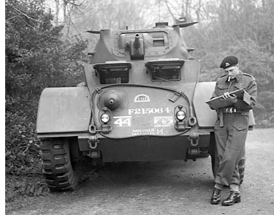
Above: T17E1 Staghound of the 12 th Manitoba Dragoons in England, 1943.

Remarks: Canadian Staghounds came from the British Lend-Lease order, only one vehicle was delivered directly to Canada as part of Lend-Lease to that country (see US for vehicle details).