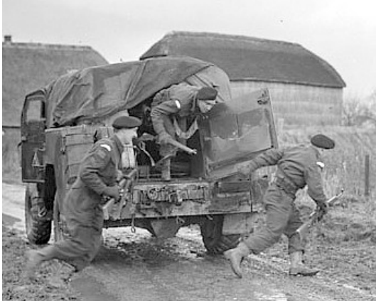
Above: Canadian GM 15-Cwt armored truck in Northern Europe, 1944.