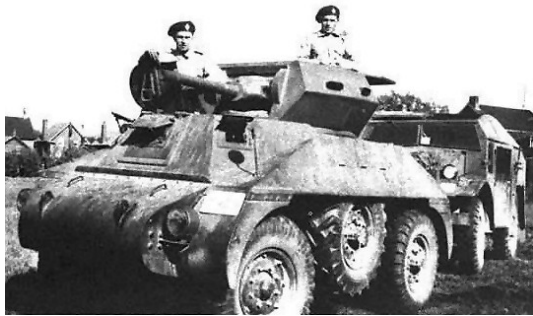
Above: The single completed Hamilton Bridge Wheeled Tank. The two spares were mounted on free wheeling hubs to help keep the vehicle from being "high-centered".

Remarks: In 1941, one pilot vehicle of a 4x4 armored car was produced by the Hamilton Bridge Company using a Canadian Ford rear engine chassis. At first listed as a Wheeled Tank, had development continued it would have been changed to a reconnaissance vehicle. As it was, any further work was diverted to the development of the GM Chassis based Fox armored car.