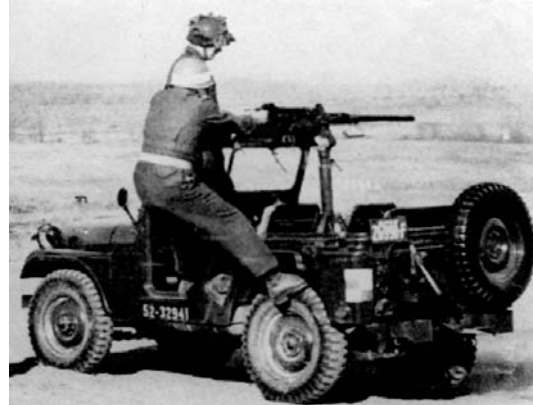
Above: Canadian M38A1 with .50 caliber HMG during firing exercise in 1960.

Remarks: Canadian military jeeps were built by Ford of Canada (see US for vehicle details).