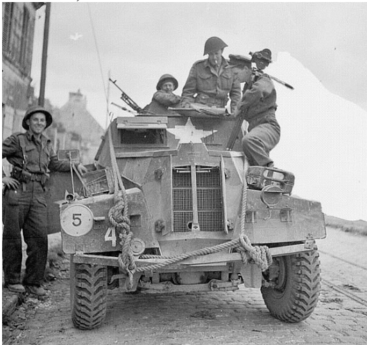
Above: Canadian Humber LRC in NW Europe.

Remarks: (See UK for Humber LRC details).