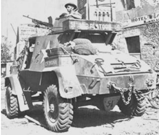
Above, Otter Mk I in NW Europe with a full load of kit.

Remarks: The Canadian Otter Mk I was developed as an alternative to the British Humber Light Recon-naissance Car, Mk III. A closed 4x4 vehicle, the Otter carried a crew of three in an armored compartment mounted on a front engine chassis designed by General Motors for road and cross country operations. During operations the driver and vehicle commander usually occupied the front seats (driver on the right, commander on the left while facing forward) with the gunner in a small open topped turret which could be manually traversed through a full 360 degrees, while the weapon itself was fitted in a spring loaded combination AA or ground mount. An armored truck was also made from the same basic design.