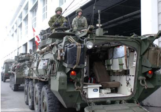
Above: Lord Strathcona's Horse (Royal Canadians) Light Armoured Vehicle (LAV III).