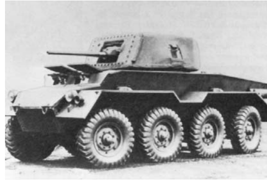
Above: The single Wolf armored car, only the RAM I turret with 2-pounder gun was fitted.

Remarks: The development of the Wolf arose from an August 1940 proposal by the Dept. of Munitions and Supply. DM&S was concerned that Canada might lack the heavy-engineering capacity required to produce tracked vehicles and that rather than build tanks they should take advantage of Canada's auto-motive industry to build "wheeled tanks" instead. Two designs were commissioned from Ford, a 4x4 with two extra floating wheels completed in late 1940 and quickly consigned to oblivion by the Canadian Army, which opted for the GM Fox I. The other was to be 8x6 (again with two extra floating wheels - DM&S had engaged the services of an exiled French Colonel, J. Martin-Prevel, who claimed to have experience designing AFVs. The Wolf grew into a 8x8 with eight-wheel steering. As there was no firm requirement the project was canceled in May 1942.