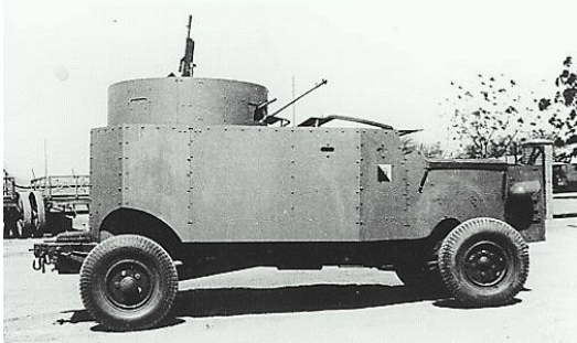
Above: Sudan Ford Local Pattern 1 armored car with turret, .55 caliber BOYS anti-tank rifle and .303 light machine gun.